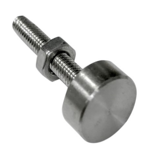
Sensor Pad Supplied

Touching the sensor pad supplied, switches the 240VAC supply to the lighting circuit. Featuring adjustable touch sensitivity, the unit can be set to suit customer requirements.